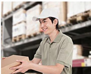
warehousing and logistics

Mobile payment, card, chain retail, express supermarket, production and manufacturing, warehousing and logistics, warehouse management, food traceability, power meter reading, asset inventory, medical and health.